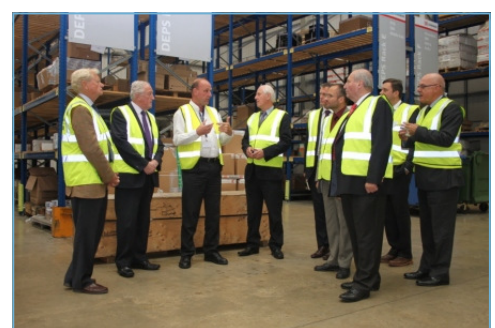
Afterwards members were given a guided tour of the warehouse.