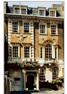
Royal Over-Seas Club