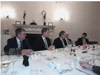
The German Ambassador speaking

The German Ambassador then spoke about British German relations, with emphasis on business, reaching out in particular to strengthen relations with Government and building bridges, supporting our lobbying.