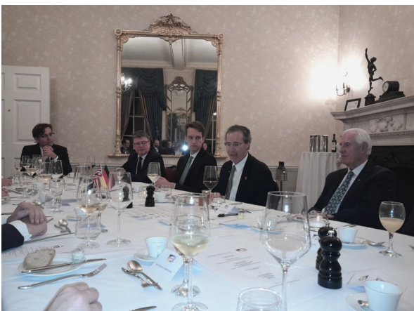
Participants during the discussion